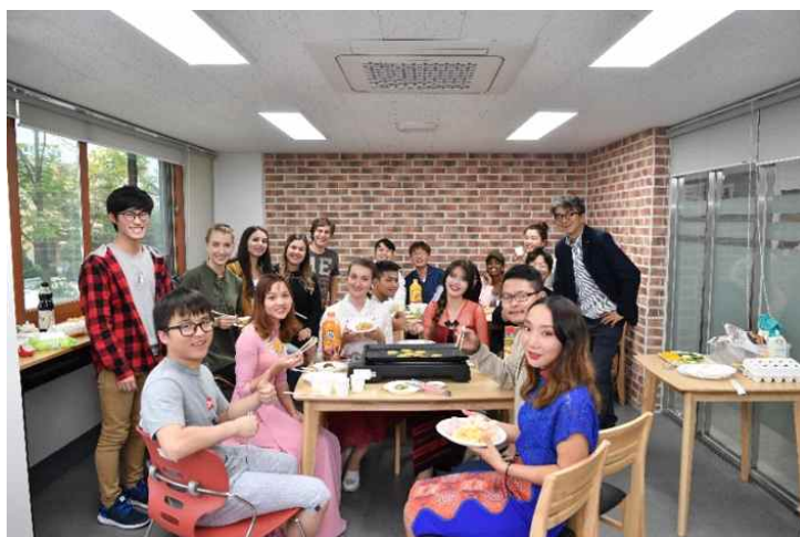
(HID Kitchen area)

It is not possible to change your housing option once you arrive on campus, due to the fact that typically all of our dorms are full each semester. Please think carefully before selecting your housing option.